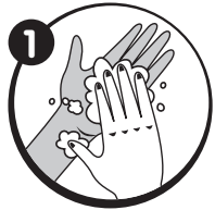
1 Palm to palm (inside of your hand)