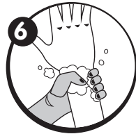
6 Your wrists