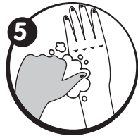
5 Your thumbs