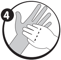
4 Tips of fingers