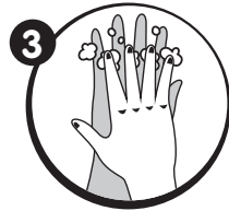
3 In between fingers