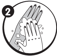
2 Back of hands