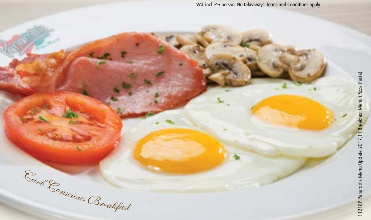
Carb Conscious Breakfast

VAT incl. Per person. No takeaways. Terms and Conditions apply.